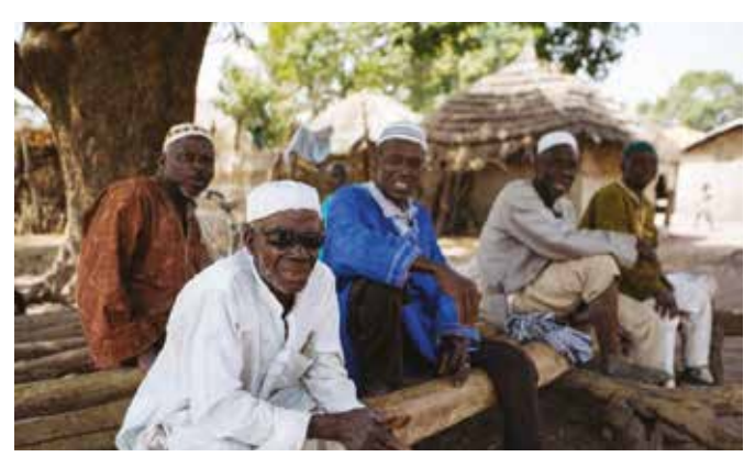
Above: Men socialising in the centre of Tonguia village, Senegal.

Citizen Voice and Action is a World Vision model that mobilises and equips communities to monitor government services and facilitates an advocacy methodology that results in the improvement of inadequate government services. In Senegal, World Vision works through faith leaders to help communities