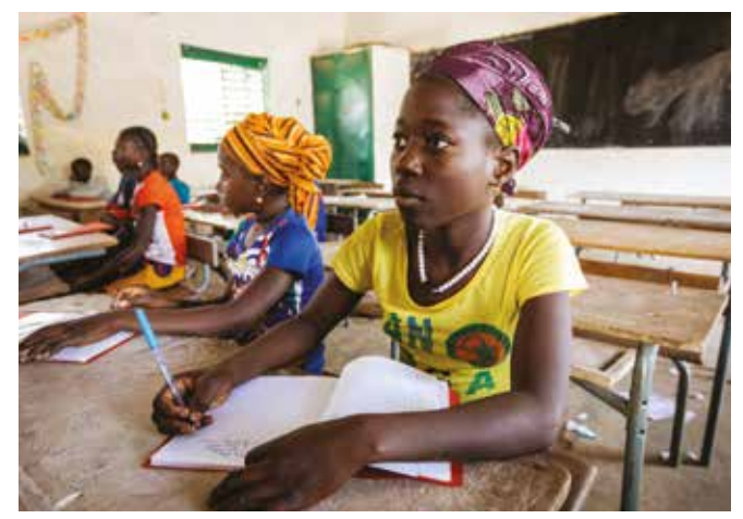
Above: Teenage girls in school, Tonguia village, Senegal.

understand their legal rights and to mobilise advocacy groups which aim to hold the government accountable. A notable achievement within this area is that a group of 100 children visited the Presidential palace to speak about early child marriage and to present the president with a memorandum. The President was so moved by their words and the cause they spoke of that he set up a new ministry of children as a direct result.