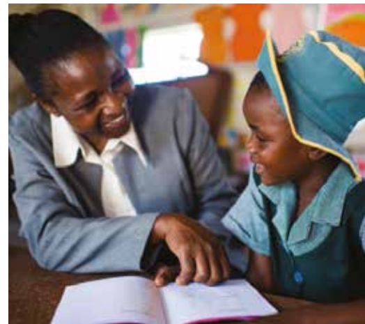
Above: Literacy unlocked – boosting reading skills in Zimbabwe.

training combines creative approaches such as games, activities and reflection times. Such training has provided young people, primarily teenagers and from the Apostolic Church, with space to reflect about important aspects of their life such as their identity, their values, their sources of security and self-worth and their vision for the future. Groups of young people are then encouraged and empowered to set up income-generating projects such as chicken-rearing and bead-making. Some groups have been able to enlist the support of the local Council, which improves their sustainability and chances of long-term success. The Empowered World View training is Bible-based, emphasising a focus on the value of each individual, and that everyone has gifts and skills to provide for themselves.