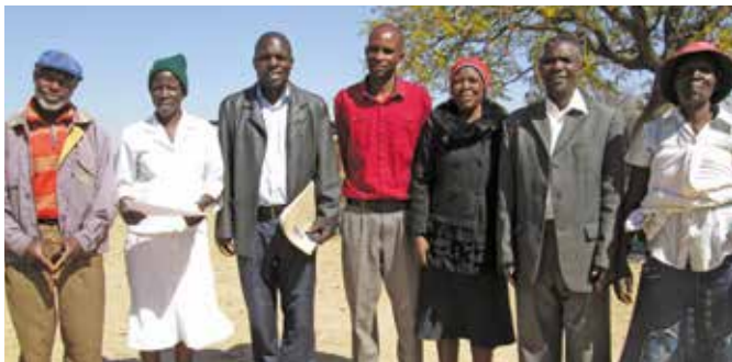
Above: Members of the Apostolic Church in Zimbabwe. The Union for the Development of the Apostolic Church in Zimbabwe Africa (UDACIZA) is a World Vision partner church in the IGATE project which empowers girls and breaks down barriers to education, enabling completion of their school years.

WorldVision's experience of operating in Zimbabwe is positive; our Christian foundation serving as an advantage when it comes to working with religious leaders and communities who generally understand and appreciate our convictions. This is less the case for secular organisations who find it harder to engage with communities, or tackle deeply ingrained harmful practices, from a faith perspective. WorldVision enjoys the freedom to communicate our Christian roots and values clearly and openly. The high levels of Christian faith in Zimbabwe provide a platform for World Vision to work with government and church umbrella groups to create partnerships that support our common objectives for child wellbeing.